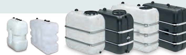
800-2500 L without profile bandages