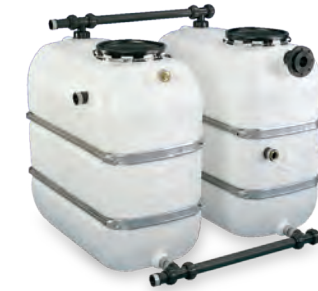
1100 L buffer tank