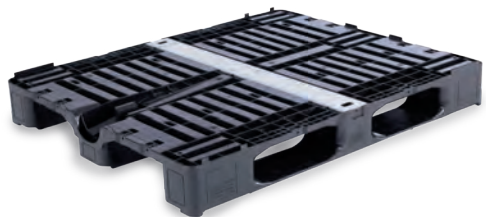
KPS 1210 for WERIT IBC