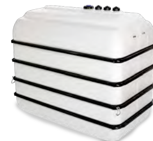
5000L with powder-coated drums for AdBlue®